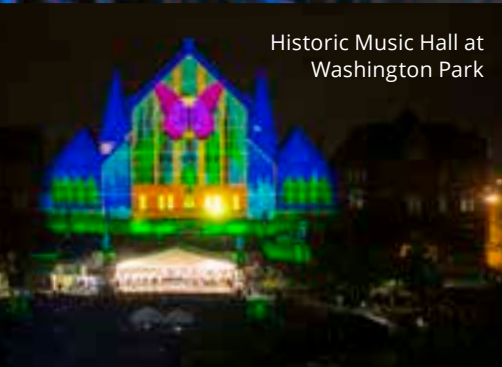
Historic Music Hall at Washington Park