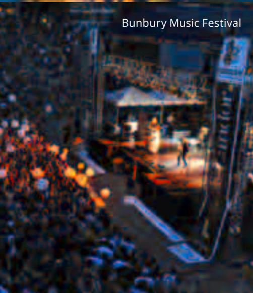
Bunbury Music Festival

TOP 5 CITIES TO LAUNCH YOUR CAREER shared by LinkedIn Workforce Insights