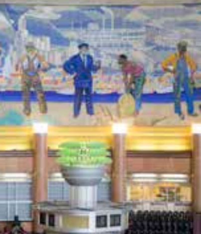
Cincinnati Museum Center