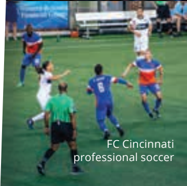
FC Cincinnati professional soccer